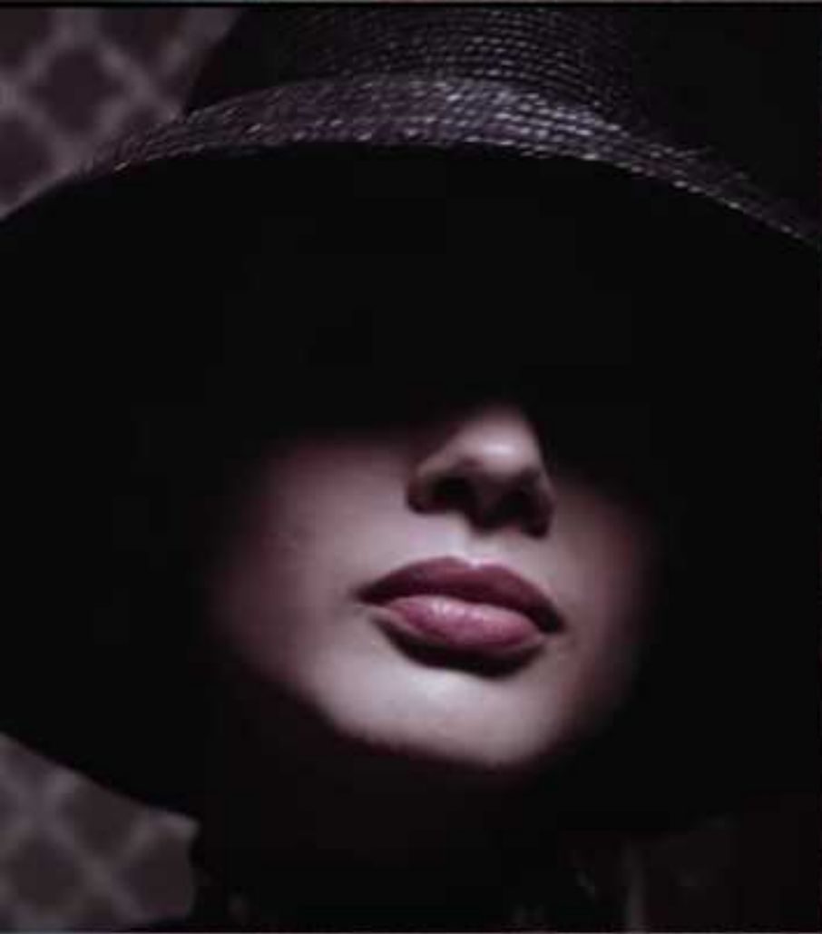
"Bruklin- Femme Fatale"

https://www.youtube.com/watch?v=yQPH6kHha5k