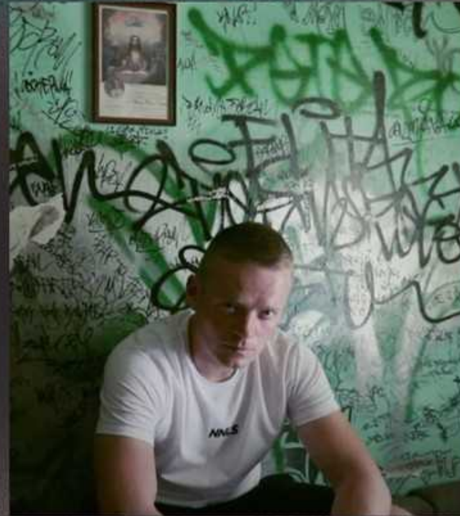
"Knaps - Skrešlitem"

https://www.youtube.com/watch?v=cKuLa9i9FOk