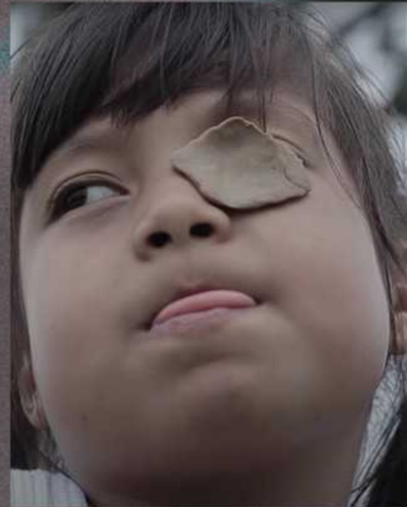
"Hania Rani - Home" (CHARITY SPOT)

https://www.youtube.com/watch?v=x6wg0Q0wIOg